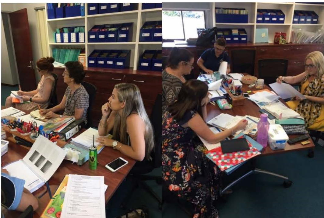
Teachers working collaboratively in PLAN Pods

What I can tell you is this.....collective efficiency, or teachers working together for the benefits of students, has the highest effect size of all being at 1.57. An effect size of 0.4 is what we consider as the 'hinge point', where you would expect to see some reasonable growth, so 1.57 tells us that when teachers work together, the benefits to our students are outstanding.