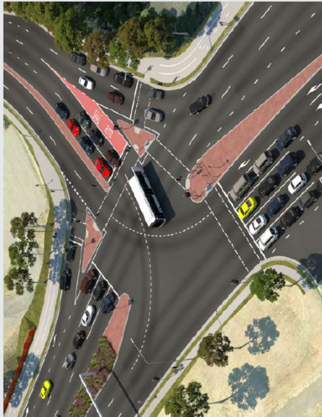
Aerial impression: Jane Street and Mulgoa Road Intersection

The concept design and Review of Environmental Factors was placed on public display for feedback in November and December 2016. A submissions report summarising feedback received during the consultation period is currently being prepared. For more information about the project, please visit www.mrs.nsw.gov.au/JaneStreetMulgoaRoad .